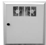
Door-mounted Rear Fan Option (replaces combined fan/power strip accessory)

800-834-4969 in US & Canada • www.chatsworth.com